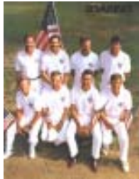
The 1991 U.S. Team

In 1950, when the legendary Paul MacCready represented the United States at the World Gliding Championships in Sweden it was simple - one pilot, one sailplane, one winner.